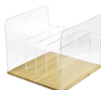
VINYL LP R